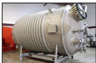
Heat Exchange & Pressure Vessels.