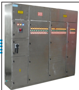
Electricals Panel Bord Plant