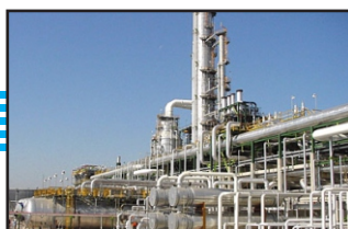
Oil Refinery Pipelines Plants