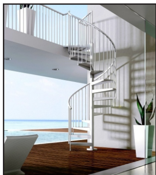
House Hold Articles