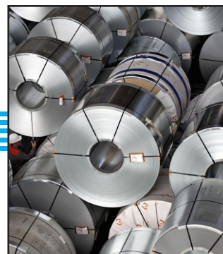
Stainless Steel User