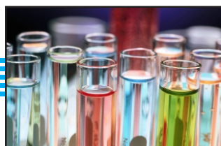
Chemicals Machinery Plant