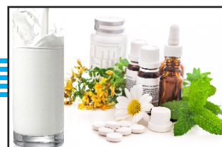
Pharma, Dairy & Food Process Plant